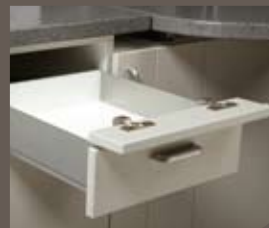
Equipment Drawer A pull-out equipment drawer with a split fold-down front offers storage and convenient access to auxiliary equipment.