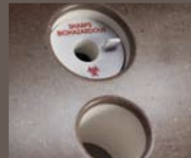
Waste Chute A combination waste chute and recessed Sharps container is available.