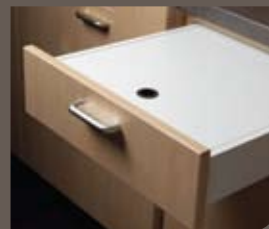
Writing Surface A lift-up writing surface is provided in the sink base storage area.