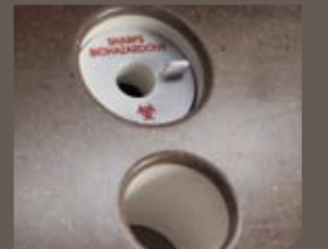
Waste Chute A combination waste chute and recessed Sharps container is available.