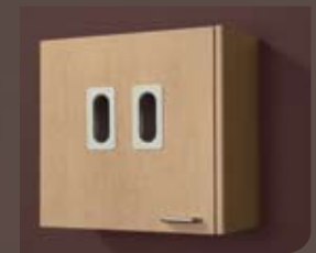
Glove, Towel and Cup Dispenser Dispenser modules provide a sanitary storage solution for gloves, tissues, masks, towels and cups.