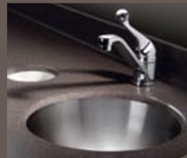
Solid Surface Countertops Corian® solid surface countertops include an integrated backsplash, a waste chute and undermount stainless steel sink.