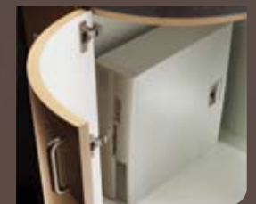
CPU Storage Unit The RS7210 Side Station features a round CPU storage module with cooling fan.