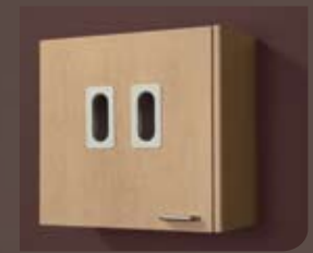
Glove, Towel and Cup Dispenser Dispenser modules provide a sanitary storage solution for gloves, tissues, masks, towels and cups.