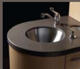
Solid Surface Corian® solid surface countertop with an undermount stainless steel sink is standard.