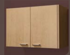
Wall Storage Module Wall storage modules offer additional operatory storage for bulk items.