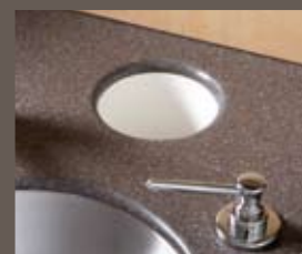
Waste Chute Waste chute with easy one hand change bag collar is conveniently located behind the sink.