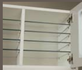
Glass Shelves Glass shelves maximize the available storage space in the upper module.