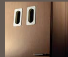
Dispensing Module Concealed glove, tissue and mask dispensers are available for the door or sides of the dispenser module.