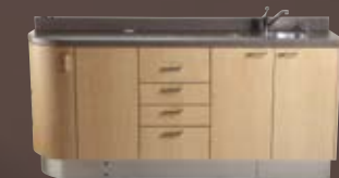
Round End Storage Functional round end storage modules are available on many models.