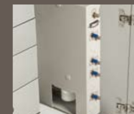
Procenter Control Panel Handpiece controls are concealed but readily accessible when needed.