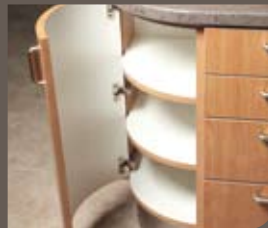
Round End Storage Aesthetic, functional round end storage with curved door.