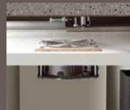
CPU Fan Dedicated CPU storage compartments include a CPU cooling fan.