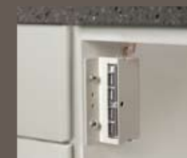
USB Hub This multiport hub provides easy access for USB connection.