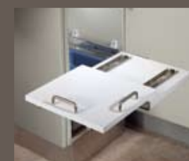
Two-way Shelves Side storage two-way shelves pull-out and forward to present support equipment and supplies.