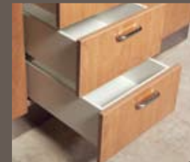
Soft Close Drawers The soft close doors fully extend to reveal the entire contents of the drawers and close smoothly with just a touch.